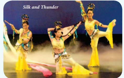
Silk and Thunder