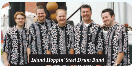
Island Hoppin' Steel Drum Band