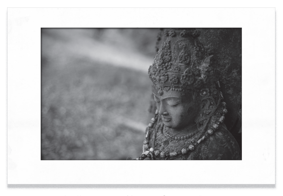
AN EVENING OF TIBETAN SINGING BOWLS